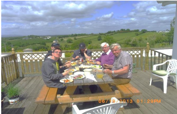
Meeting new people