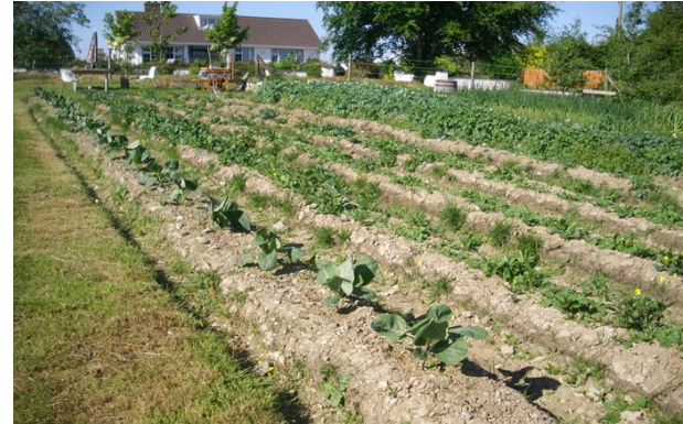
Preparing ground for organic plantation