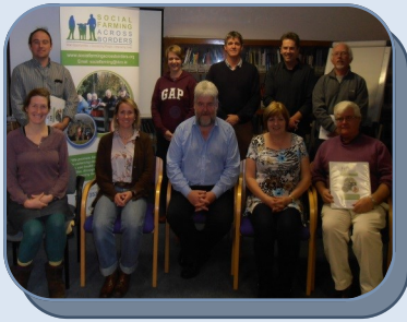
Training in Leitrim

The pilot farmers have completed 8 days of training with the project in the last quarter of 2013 in Leitrim Development Company's offices and in Greenmount College Antrim.