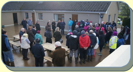
The group gather to hear about Social Farming at Mabel's Farm in Tyrone

The project held five 'Network meetings' across the region during the first 18 months of the project. At the suggestion of the pilot farmers and in agreement with the project funders we have reshaped these network and awareness raising opportunities into more local focused occasions drawing on the availability of our pilot farmers as local hubs of activity.