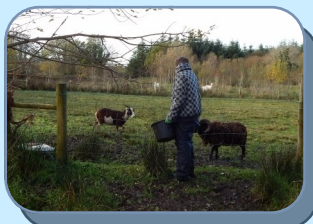
Feeding the animals at Natascha's

The community were also evident in the activities around these farms with a number of projects having community groups as part of the farm activity. Two notable examples being Larry and Seaghan's farms which both have other community garden projects associated with their farming activities. These have been significant occasions for participants to meet, work and share experiences with others.