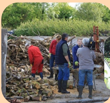
Nationwide Film Crew in Fermanagh & Leitrim