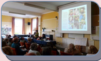
Let Nature Feed your Senses

During the last quarter of 2013 and early 2014 events the SoFAB team attended included the following