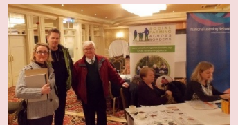
Cavan Macra—Positive Mental Health