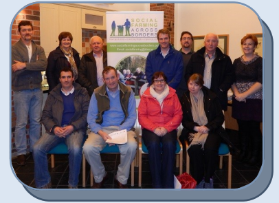
Training in Greenmount

Key areas covered over the eight days were— Background and history and the evolving changes in service provision, Values for Practice, Risk Management, Activity planning, support planning, communications and reporting (project specific), Farm safety Management, The Recovery Model in Mental health & Business planning.