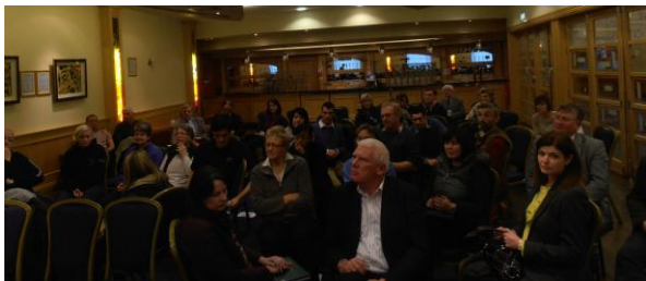
And the gathering in Armagh.