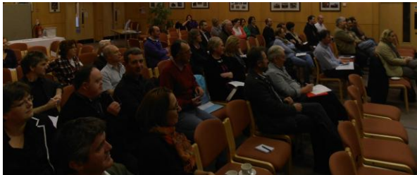
A section of the crowd at Enniskillen.